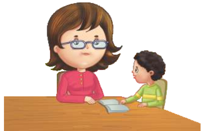
UNIT-END ASSESSMENT THROUGH RECORDS OF STUDENTS' RESPONSE IN CLASSROOM, WRITTEN WORK AND TAIL MODULES