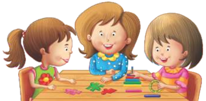
STUDENTS' CLASSROOM WORK