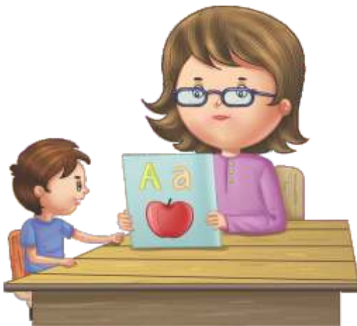
OBSERVATION OF STUDENTS' ENGAGEMENT AND RECORDING ANECDOTES IN CLASSROOM