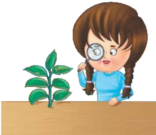
HOMEWORK AND ASSIGNMENTS